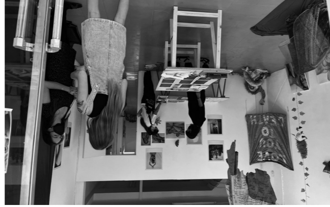
The artists during the post residency collaboration in Tangent Projects Gallery.